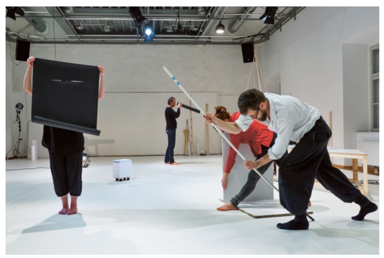
At the Method Lab of Choreo-graphic Figures: Deviations from the line, hosted by TQW, 2016.

expand its concept; combined with the writing in different layouts; combined with the photos of people moving in a space with objects put in relation with some poetic lines giving a hint what these people might have sensed and experienced at that moment. Or one might be triggered to stop and read because the promises of titles like "Becoming Undisciplinary" or "Embodied Diagrammatics", or the name of one of the authors, [7] whose fields of expertise span philosophy, artistic research, art history, critical theory, curating, theatre, dance and performance theory, sound culture, system analysis, and the intersection of media theory and theory of space.